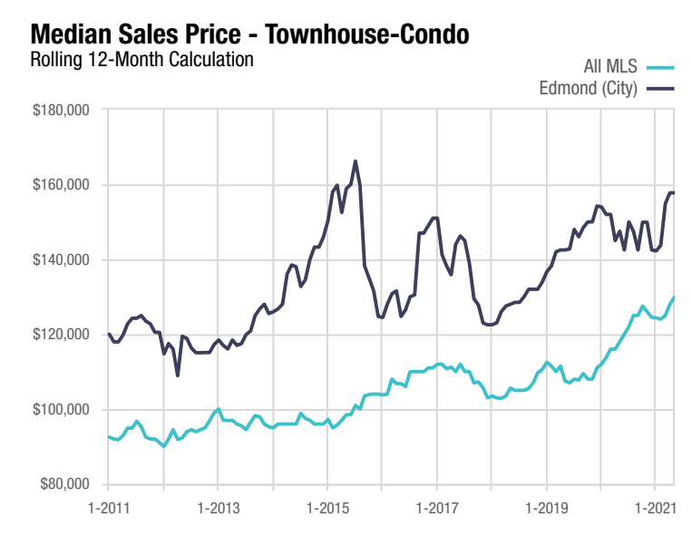
A rolling 12-month calculation represents the current month and the 11 months prior in a single data point. If no activity occurred during a month, the line extends to the next available data point.