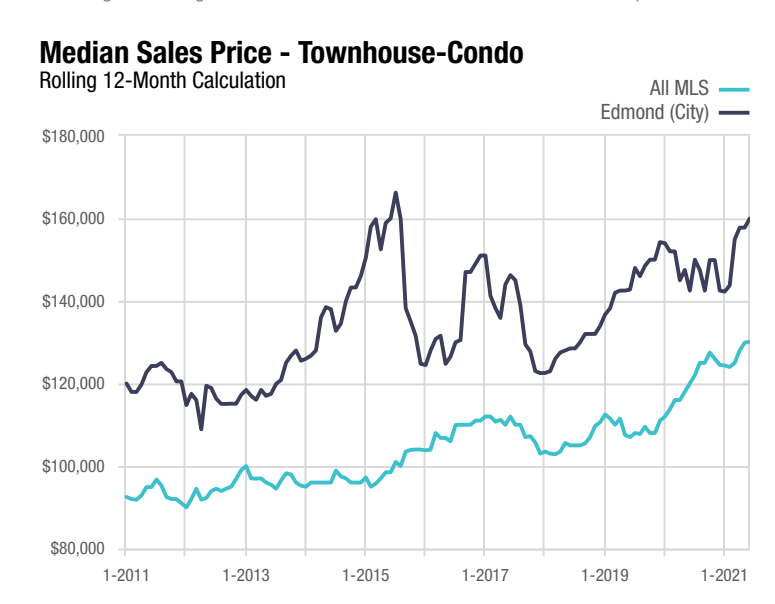
A rolling 12-month calculation represents the current month and the 11 months prior in a single data point. If no activity occurred during a month, the line extends to the next available data point.